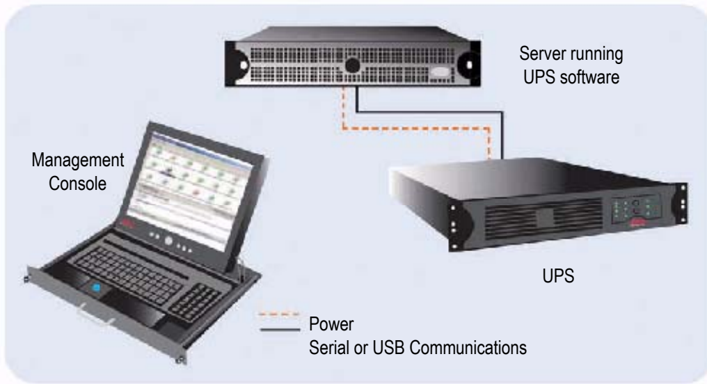
Figure 1 – Protecting a single computer with a single UPS